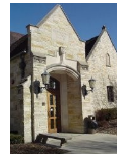
Thomas Ford Memorial Library