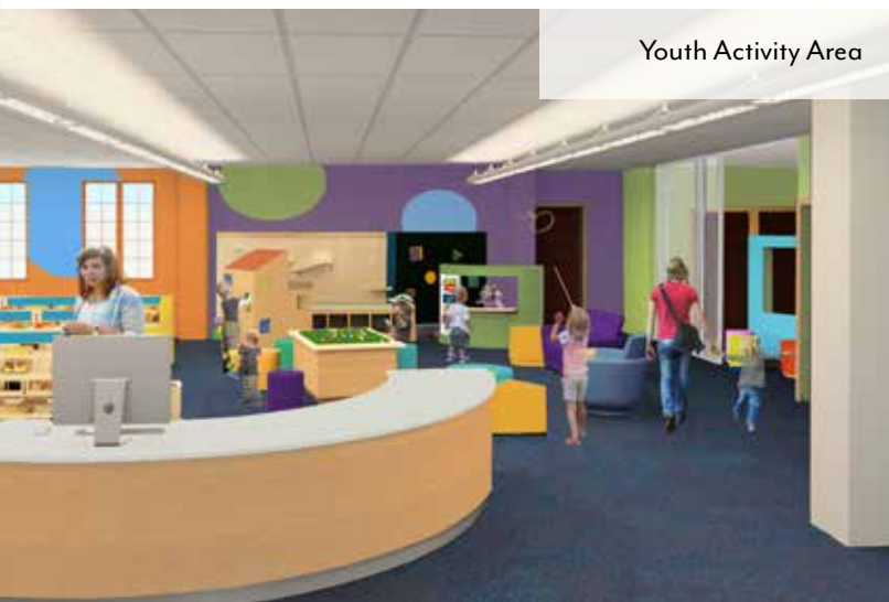
Youth Activity Area