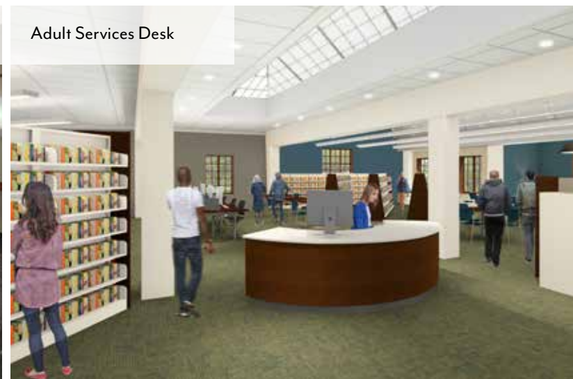
Adult Services Desk