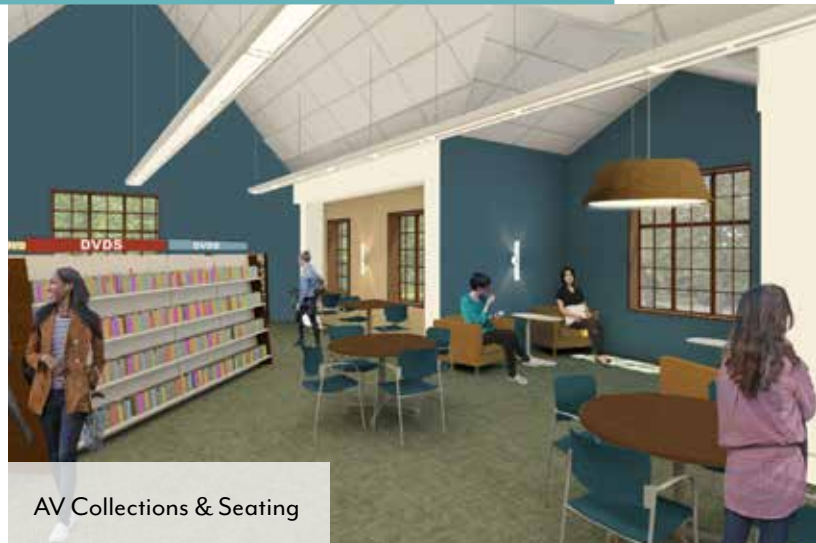
AV Collections & Seating